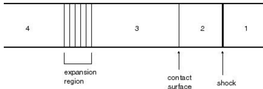
Shock Tube Process