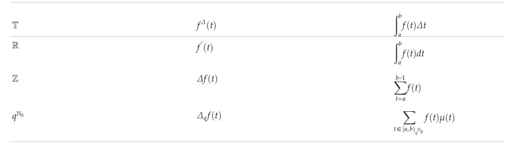
Table 2. Derivatives and integrals for most common time scales.

Table 2 shows the derivative and integral definitions for the most known time scales for a, b \in \mathbb{T} .