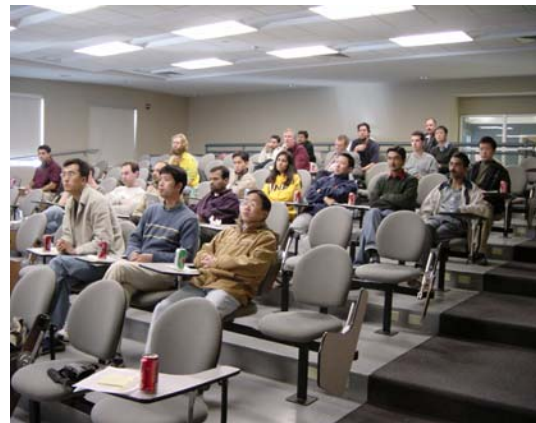
Faculty and student members at Eberhart's lecture