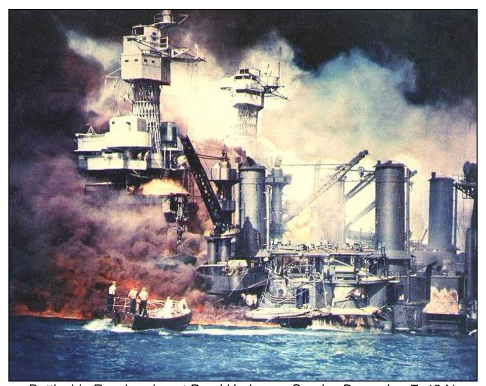
Battleship Row burning at Pearl Harbor on Sunday December 7, 1941.

The passage of the Freedom of Information Act in 1980 enabled researchers to begin unraveling the kaleidoscope of events leading up to the disastrous attack on the U.S. Pacific Fleet at Pearl Harbor on December 7, 1941. The release of this data was timely, insofar that it allowed interviews with many of the surviving witnesses of the events that shaped history. These individuals had remained silent to honor security-imposed guidelines during the previous four decades. Foremost among those most familiar with the Pearl Harbor attack was Rear Admiral Edwin T. Layton, Chief of Intelligence for the Pacific Fleet before the attack and the duration of the Pacific War. As a flag rank officer, Layton was able to research the events surrounding sneak attack on Pearl Harbor, sifting through myriads of classified documents. His memoirs, published in 1984, represented the most significant contribution to the understanding of the Pacific War up to that time, shortly before his death in 1986.