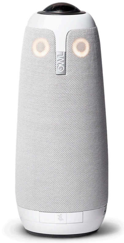
MEETING OWL PRO WEBCAM