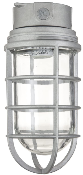
SUNLITE 04901-SU INDUSTRIAL FIXTURE