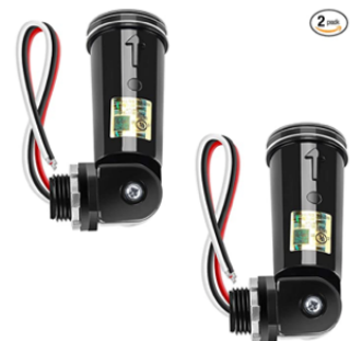
2 PACK PHOTOCCELL SENSOR SWITCH