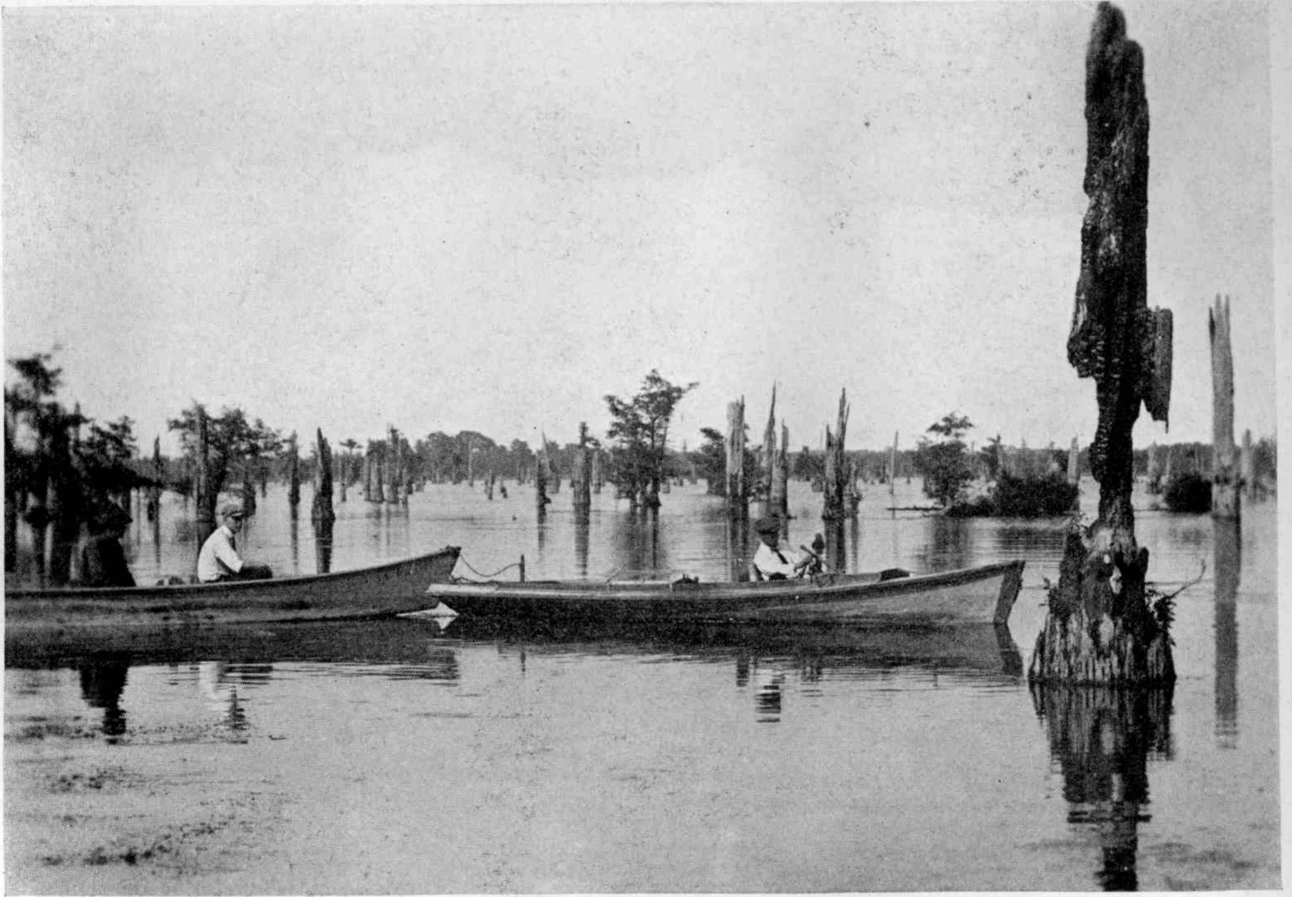
TRAVERSING THE DEAD CYPRESS STUMPS OF REELFOOT LAKE

shocks, which did no essential injury, that the lands were gradually rising again in value, and New Madrid was slowly rebuilding with frail buildings adapted to the apprehensions of the people."