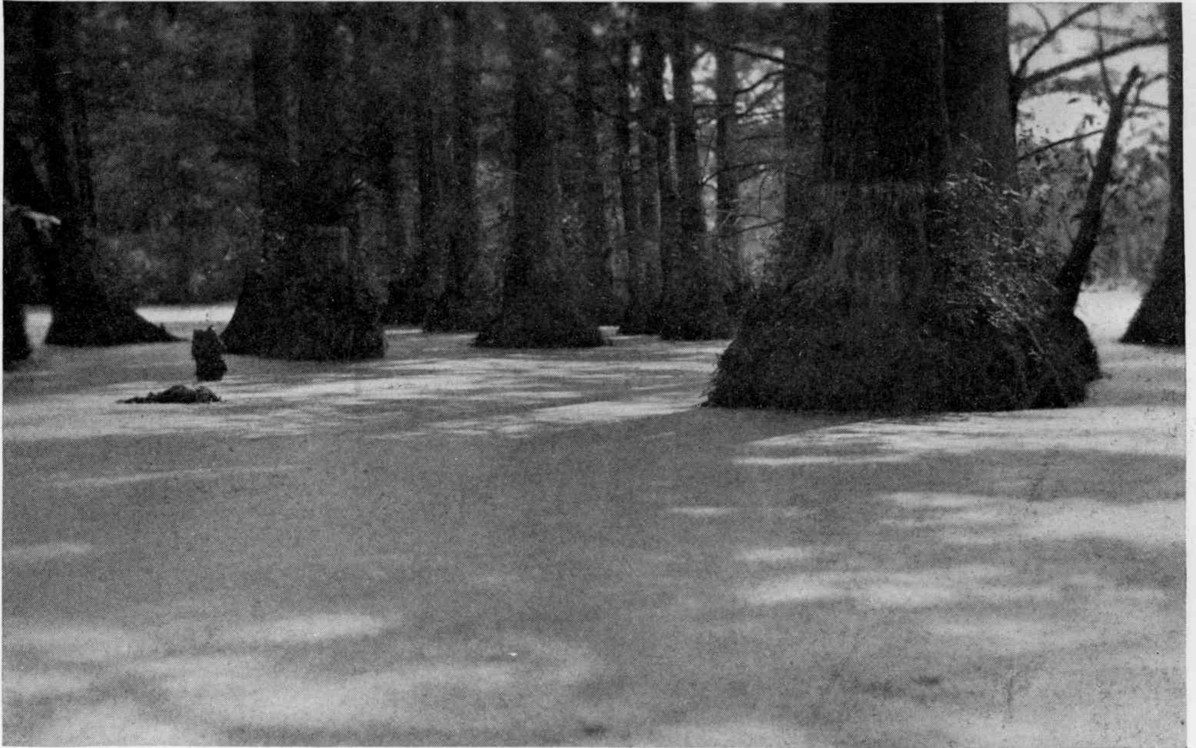
CYPRESS TREES GROWING IN WATER COVERED WITH A CARPET OF SEED MOSS

facts were greatly exaggerated. For example, the 100-mile lake is nearer 14 miles in length and 4\frac{1}{2} miles in width.