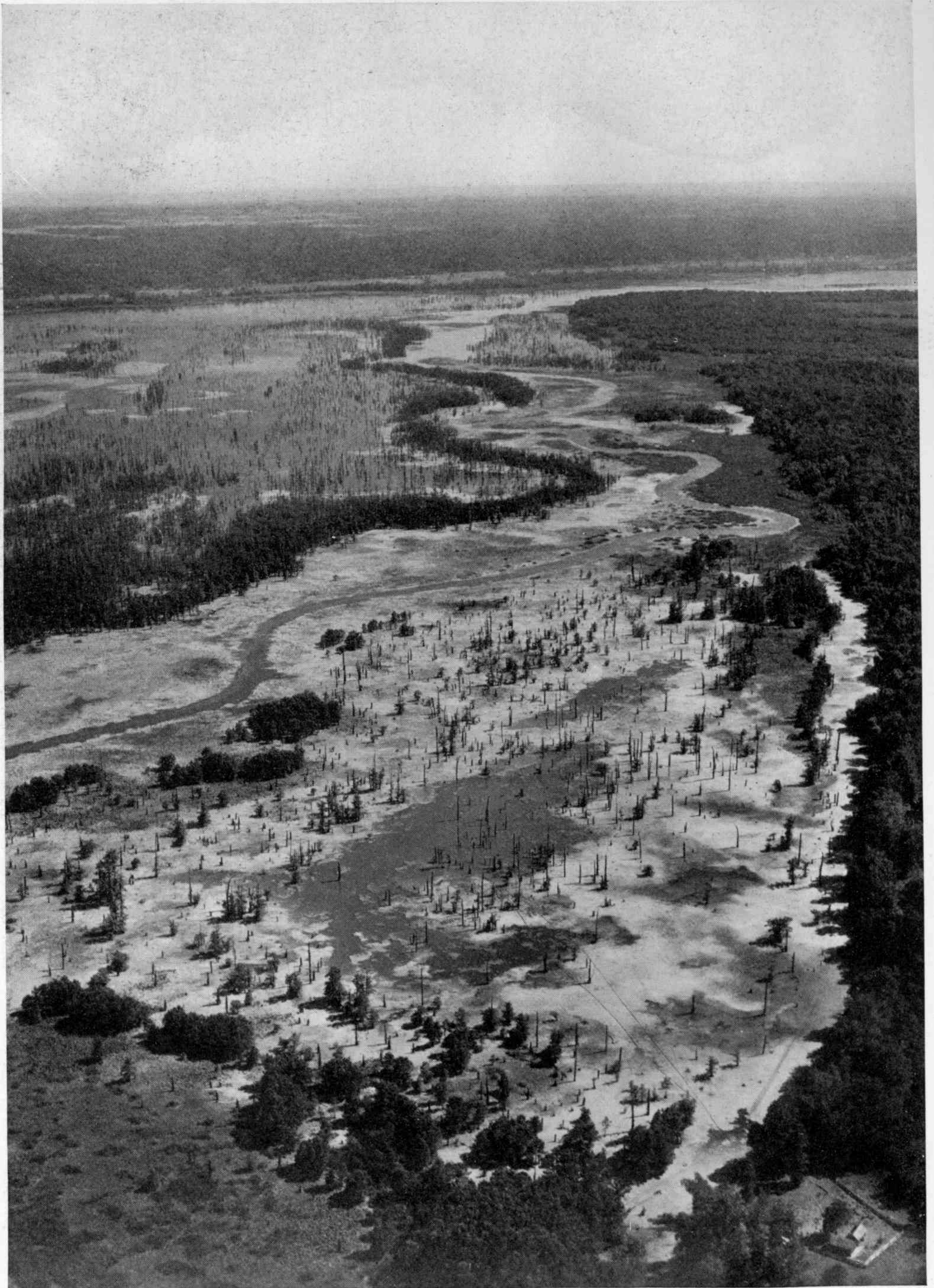
AËRIAL VIEW OF THE NORTHEASTERN CORNER OF REELFOOT LAKE, SHOWING THE SUBMERGED CHANNEL OF BAYOU DE CHIEN

The channel shows up clearly in this airplane view, as the water is much deeper than the shallow lake water, and the lily pads only grow in shallow water, up to the banks of this old submerged channel. To the left of the Bayou de Chien are masses of cypress trees growing in water five feet deep (see also illustration, page 105).