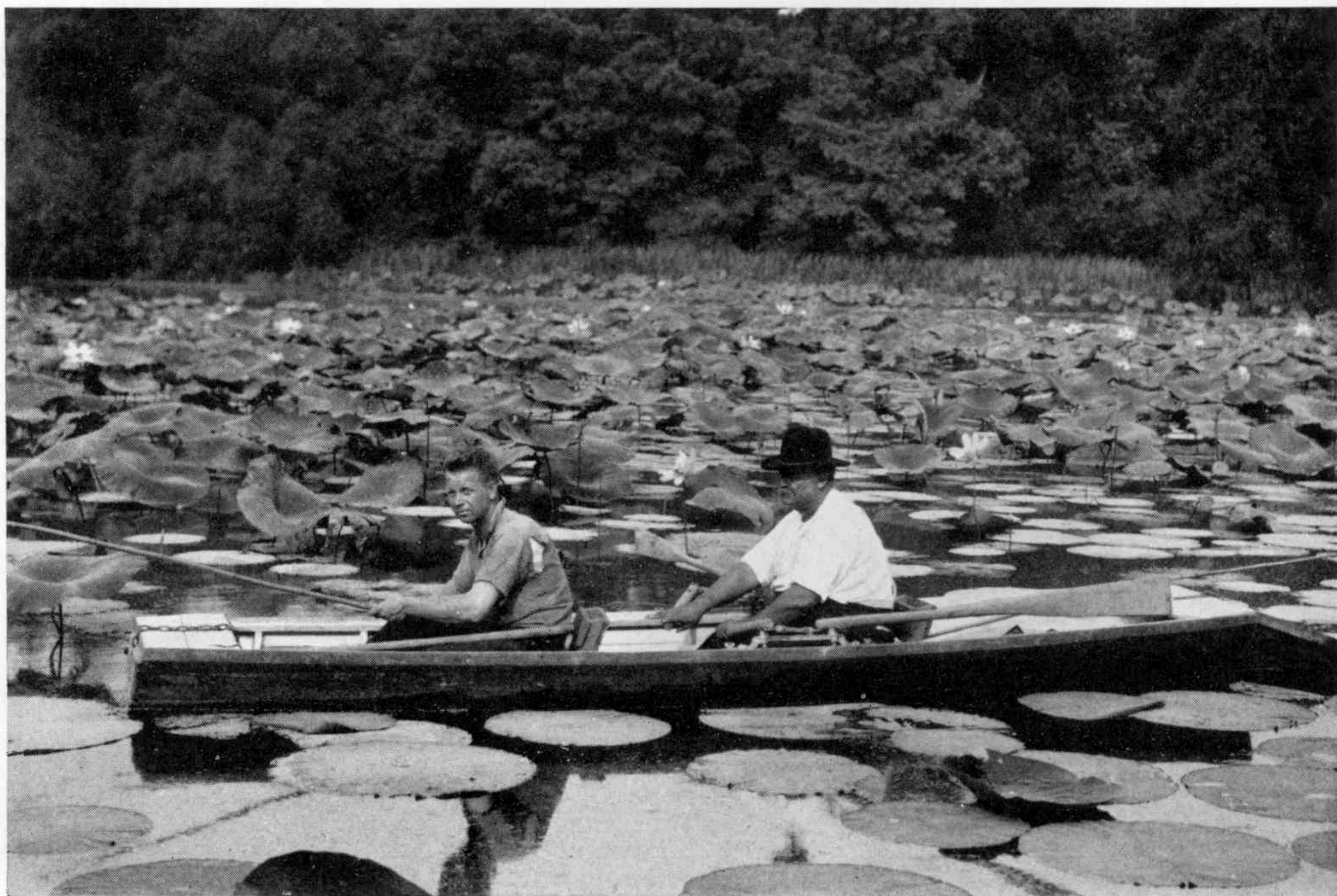
AN AREA COVERED WITH YONCOPIN LILY PADS

This American equivalent of the Egyptian Lotus is the chief flower of Reelfoot Lake.