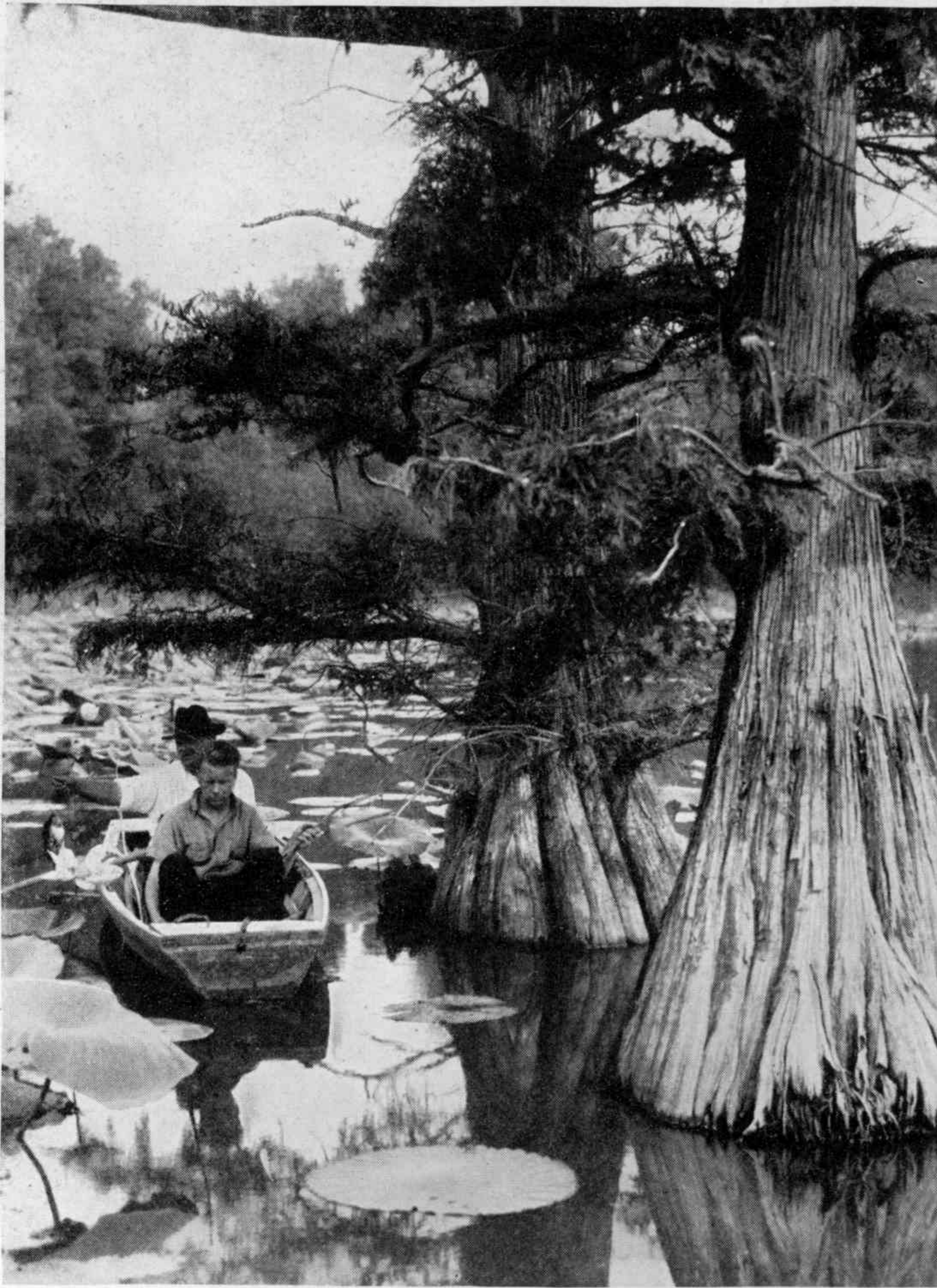
SECOND GROWTH OF CYPRESS TREES IN REELFOOT LAKE

clays, and under this surface soil was layer after layer of loose sand and clay, down to a depth of 2,000 feet.