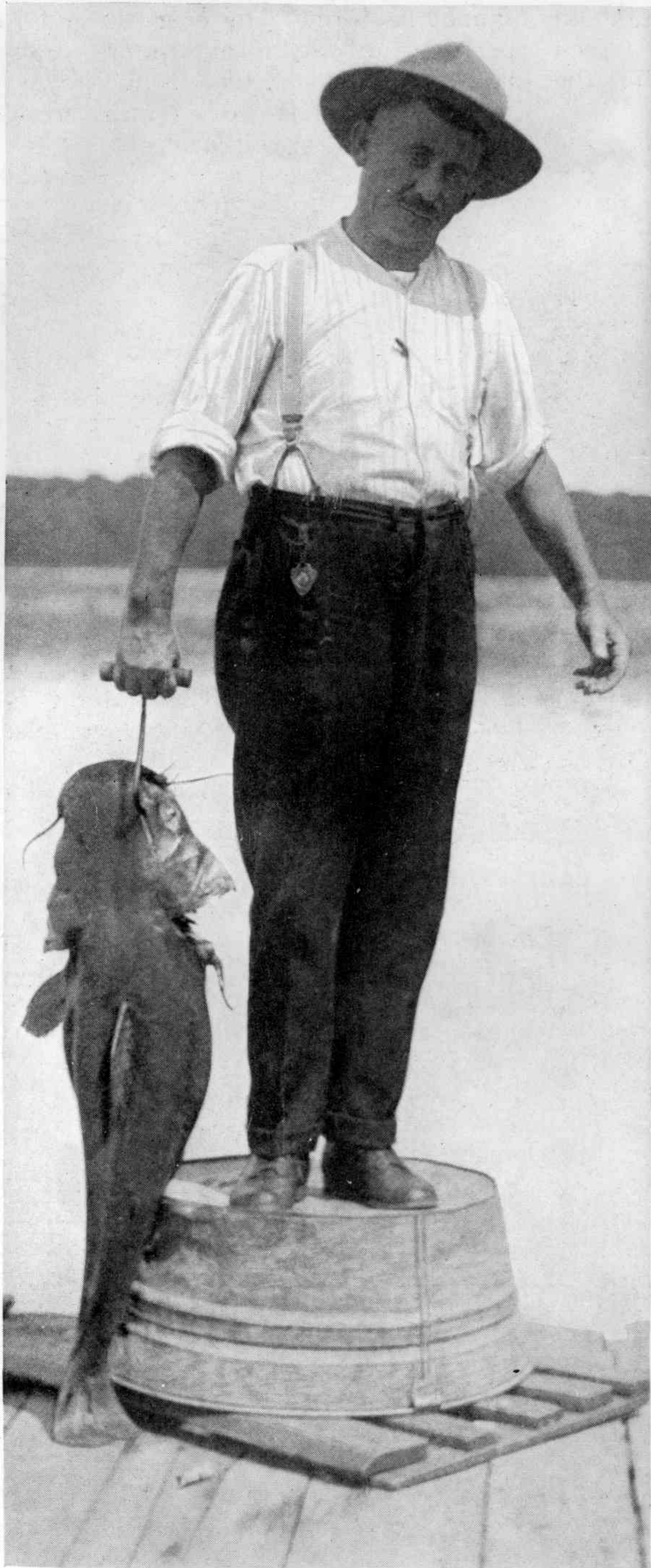
A THIRTY-FOUR POUND CATFISH TAKEN IN REEL-FOOT LAKE

The waters of this region teem with Bream, Gar, Crappie, and many other varieties of fish, which are caught in quantities for market.