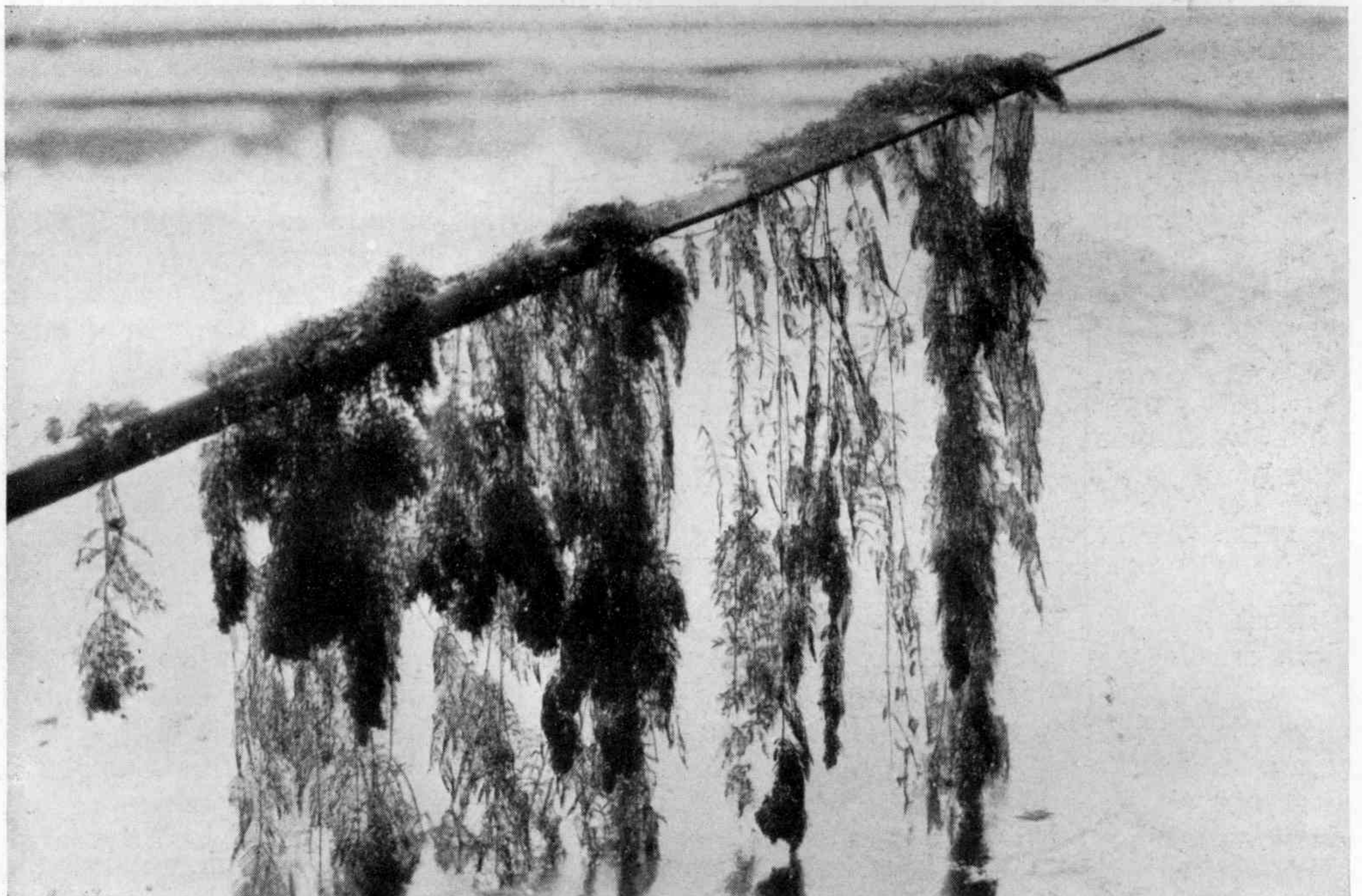
VEGETATION WHICH HAMPERS MOTOR BOATING ON REELFOOT LAKE Water milfoil ( Myriophyllum ) grows profusely in the northern part of the lake.