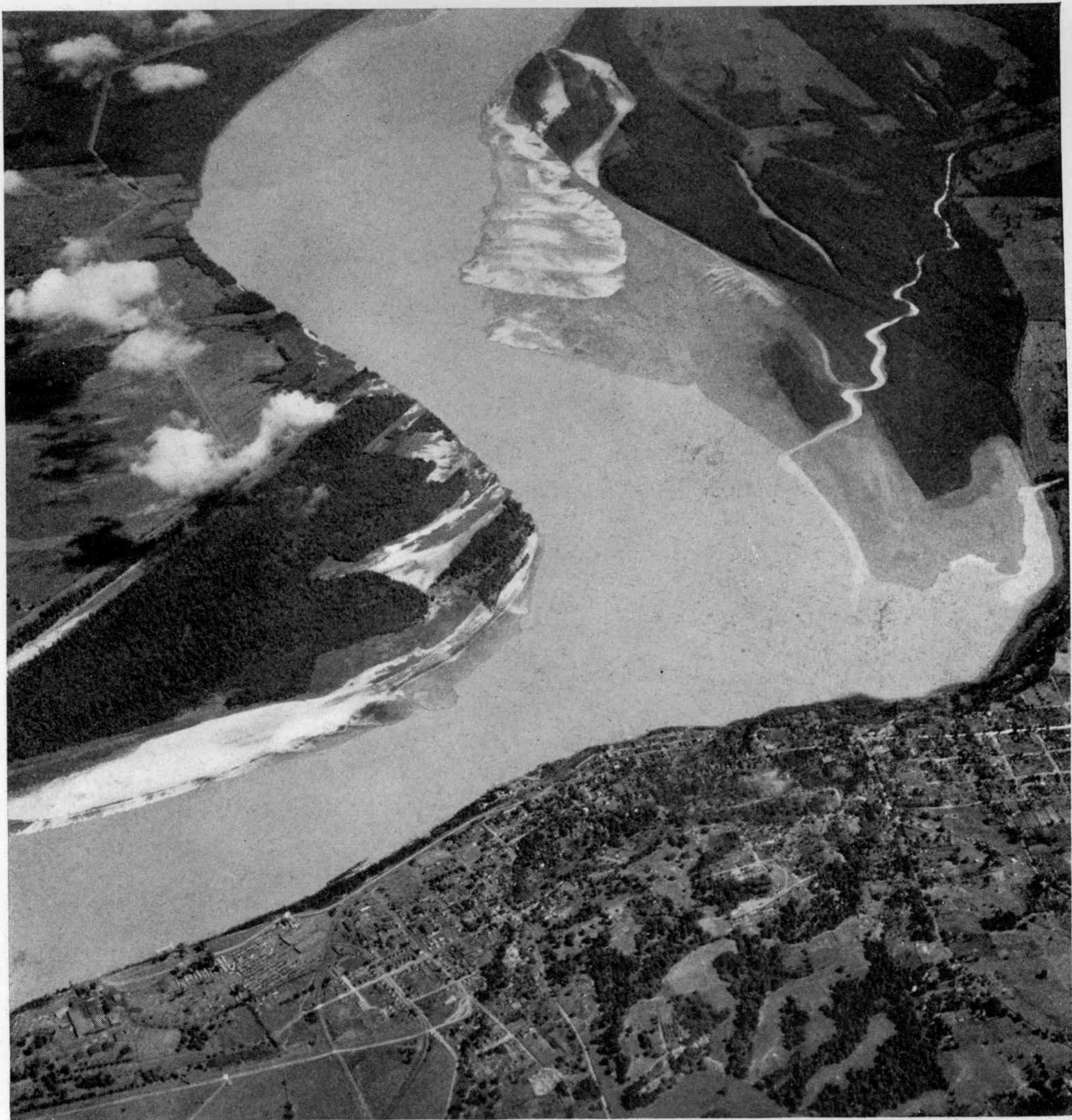
HICKMAN, KENTUCKY, JUST NORTH OF REELFOOT LAKE

The town lies a few miles north of the Tennessee line and is located on a 300-foot bluff at the edge of the Mississippi River. The white strips which look like reflections, on the right bank of the river, are submerged sand banks.