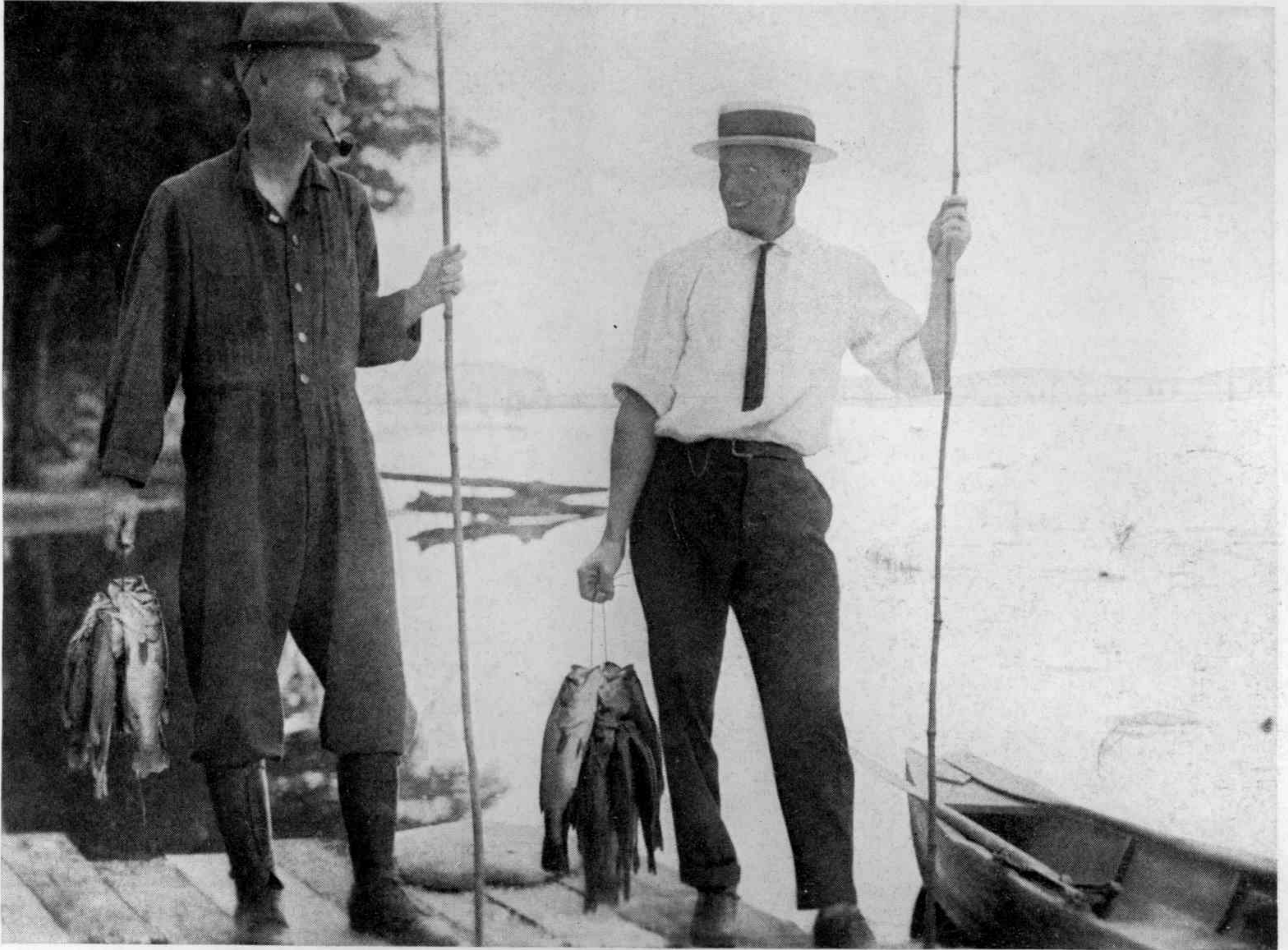
A CATCH OF REELFOOT LAKE FISH AT SANSBURG

along with our friends the opossum and raccoon.