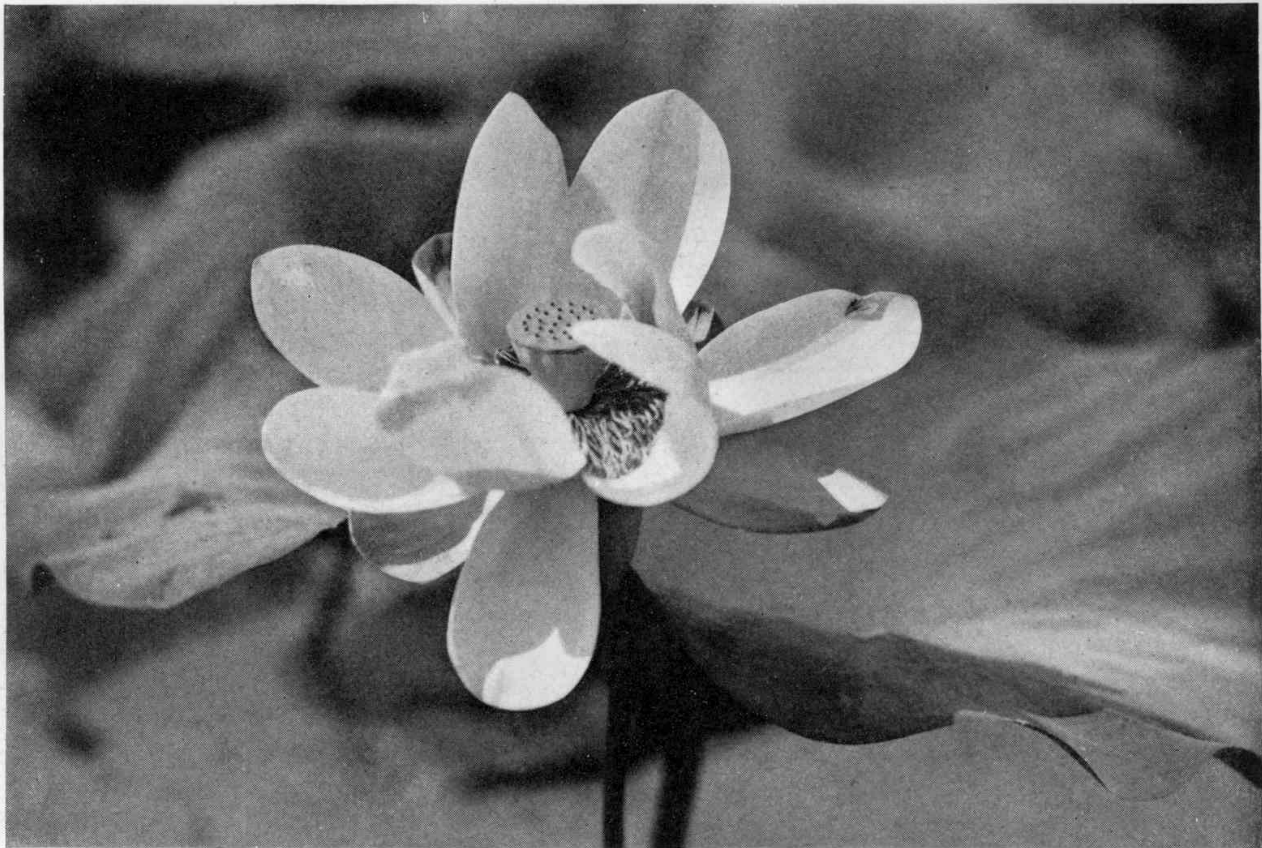
A FULL-BLOWN BLOSSOM OF THE BIG YELLOW YONCOPIN LILY