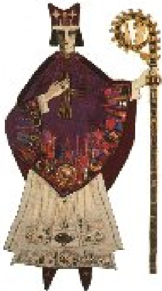
Gundulf of Bec Father of Royal Engineers