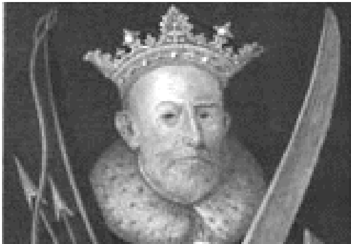
William I "The Conqueror" Norman Invasion 1066