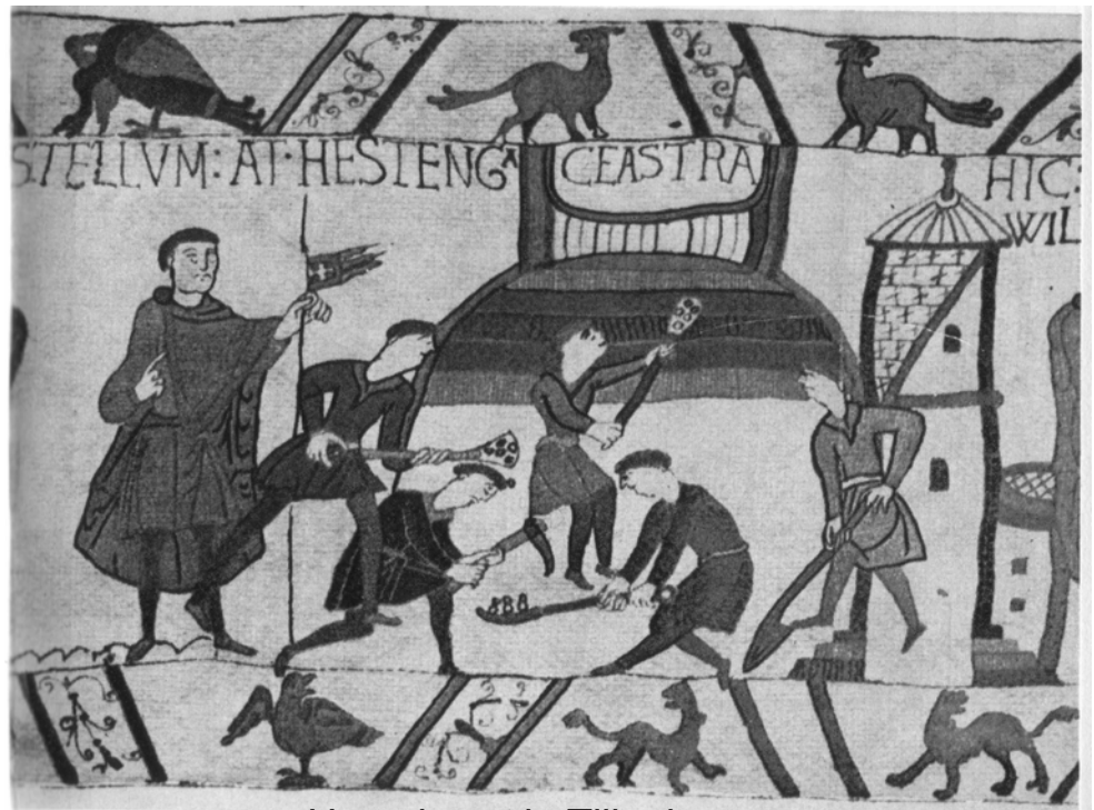
Humphrey de Tilluel Prefab fort