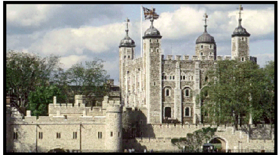
Building Castle + Building Abbey