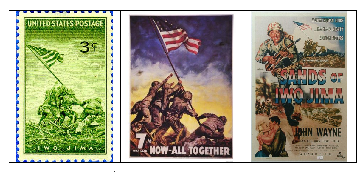
Commemorative stamp (left), 7<sup>th</sup> War Bond campaign poster (middle), and Hollywood movie bill (right) all made use of Rosenthal's dramatic image in 1945.

The image of gallant Marines raising the flag on Mt. Suribachi became the model for the Marine Corps War Memorial, more commonly referred to as the "Iwo Jima Memorial" because of the scene it depicts. The statue sits on a serene knoll in Rosslyn, Virginia, at the north end of the Arlington National Cemetery. From it one can view the Lincoln and Washington Memorials, as well as the nation's Capitol, across the Potomac River. The statue was unveiled in 1954. The height of the original men was multiplied by five, to 32 feet, while the height of the flag pole was increased to 60 feet. The figures are the largest bronze castings in the world, fashioned by Felix de Weldon.