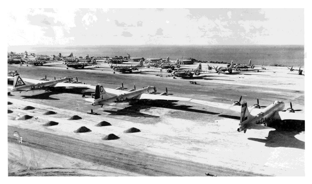
B-29s parked on the transient ramp at Iwo Jima on June 5, 1945. These were part of the 2,400 Supefortresses that made forced landings on Iwo Jima, potentially saving aircraft and crews.