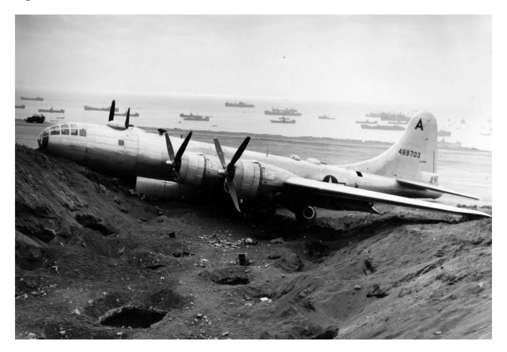
This B-29 Superfortress from the 497<sup>th</sup> Bomb Group crash landed on the beach at Iwo Jima before the airfield was taken by the Marines, testifying to the importance of the island to the bombing campaign.

conclude that quickly, without armed invasions of the Japanese home islands, beginning with Kyushu in October 1945, and, then, against Honshu in April 1946. From this vantage point, Iwo Jima and Okinawa would have served pivotal roles as staging bases for those planned invasions, which never occurred.