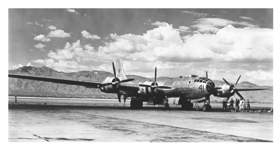
The Boeing B-29 Superfortress represented a quantum leap in technology over other combat aircraft in the Second World War, and was the only aircraft capable of delivering an atomic weapon from any meaningful distance when the war ended.

The tiny volcanic island of Iwo Jima lies a little over 650 miles southeast of Japan, about halfway between Tokyo and the American airfields on Guam, Saipan and Tinian in the Mariana Islands. Prior to World War II, the largest island, Guam, was a U.S. protectorate, and the Navy had a communications station there. Nearby Saipan and Tinian were Japanese colonies (as were Korea and Taiwan). American forces invaded the Marianas in mid 1944 and immediately began construction of what came to be the world's largest aerodrome for the Boeing B-29 Superfortress bombers of the U.S. 20th Air Force. The B-29s had previously been stationed in mainland China, but supplying them with adequate fuel was a logistic nightmare. The Marianas were seized to stage airborne strategic bombing of the Japanese homeland, about 1,500 miles distant. The B-29 was the only aircraft then in existence which had pressurized cabins, a cruising altitude of 28,000 feet, and could deliver bombs to targets with a 3,000+ miles roundtrip. In the fall of 1944 B-29s began flying bombing missions to the Japanese home islands.