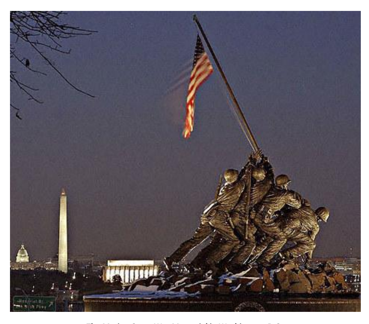
The Marine Corps War Memorial in Washington, D.C.