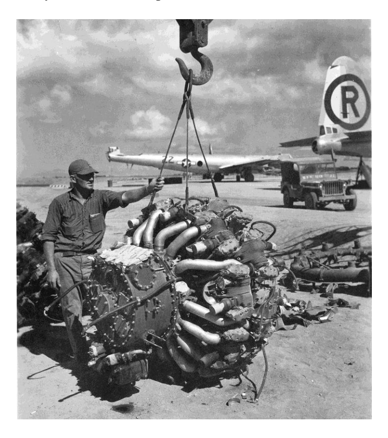
The massive Wright 3350 Cyclone engines that powered the B-29 bomber represented the zenith of 1940s piston engine technology. Each engine weighed 2,800 pounds and employed 18 cylinders, displacing 3,350 cubic inches. The B-29 consumed about four times as much fuel as a B-17 or B-24 bomber.

By early 1945 the teething problems of the Wright Cyclone engines were being worked out and the Americans were assembling massive raids on Japan, with 300 to 900 B-29s per raid. For the airmen flying the 12 to 16 hour missions, there was nowhere between their home bases and Japan to drop down and land, should the slightest of problems arise. Air-sea rescue operations were being overtaxed covering the 1,500+ mile distance between Tokyo and Guam/Saipan/Tinian.